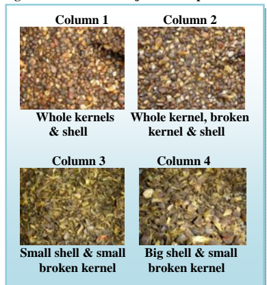
Figure 4: Products and by products from 4-stage winnowing column